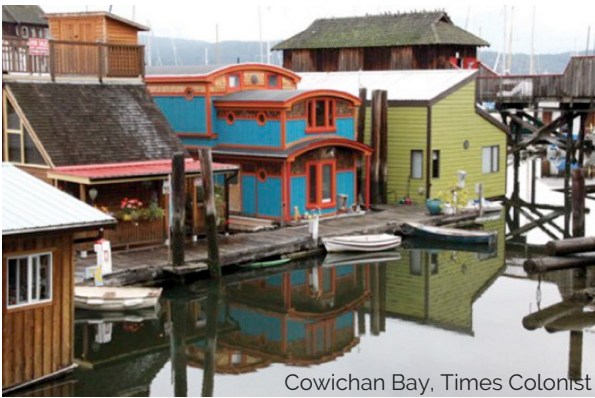
Cowichan Bay